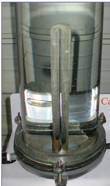
Untreated Scale build-up in untreated water