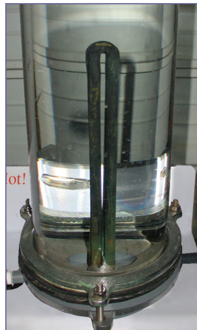
Treated No scale with treatment